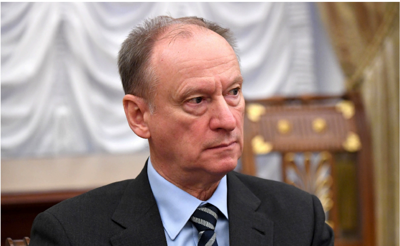
Nikolai Patrushev is Secretary of the Russian Security Council.

According Patrushev, ideas of multiculturalism and "common human values" propagated by liberal western democracies are inconsistent with Russian culture.