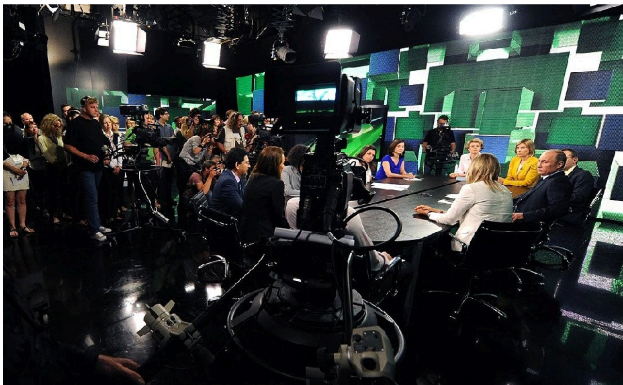
Putin pays visit to RT in 2013.

"You are the voice that people trust and respect, and lets be honest, also the voice that tells the truth and that many fear and want to silence," Putin said. 70