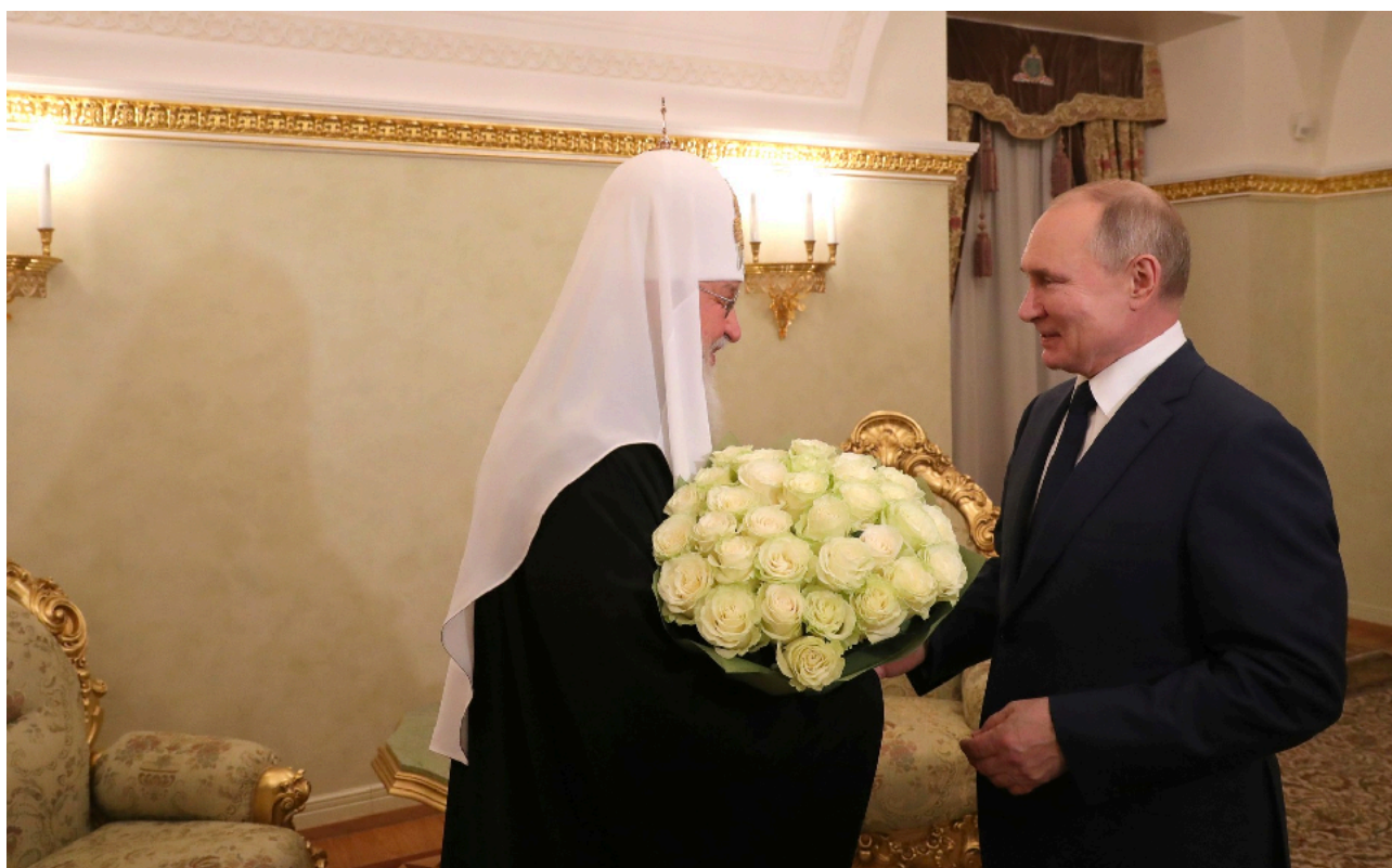
Patriarch Kirill meets President Putin the day after massive street rallies.

It later turned out that not only Putin, but also the patriarch himself, has a flush compound in Gelendzhiki on the Black Sea coast. According to media reports, the patriarchal facility has an estimated value of 22 billion rubles, and Kirill regularly comes to site to relax. 9