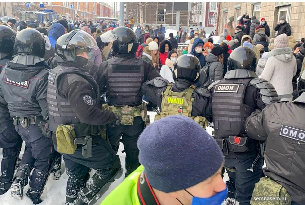
Street rallies across Russia on 31st of January. Here from Petrozavdsk, Republic of Karelia.

The response from the regime was unambiguous. Putin and his law enforcers with raw force cracked down on the nation-wide rallies that broke out after the arrest of Navalny, and legal action was instigated against several hundred.